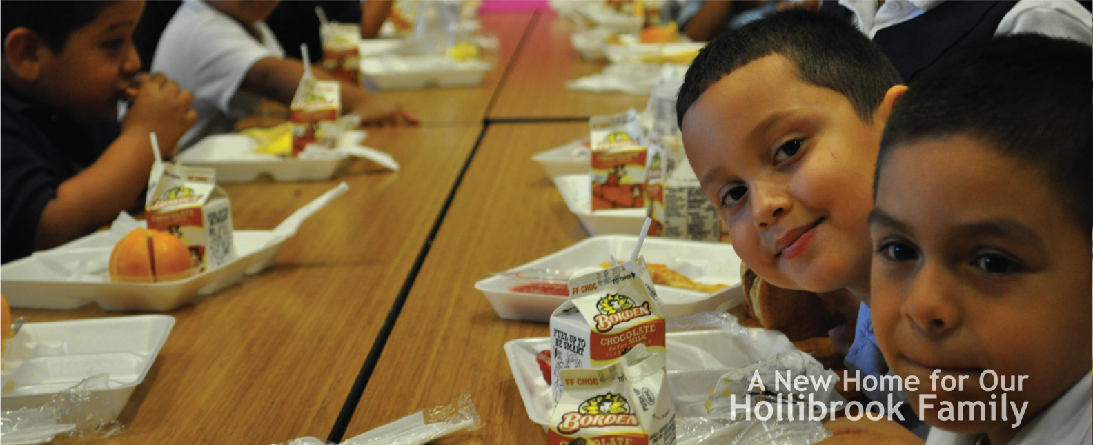
A New Home for Our Hollibrook Family