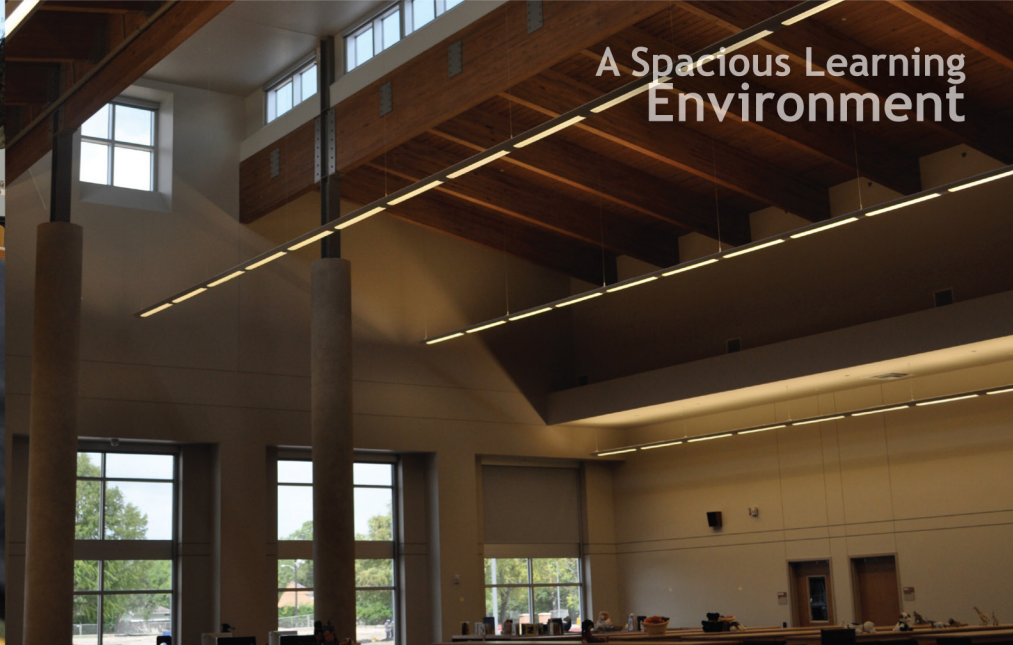
A Spacious Learning Environment